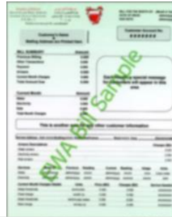
Registered address for the account of Electricity and Water