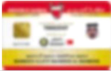
Personal address to the subscriber identity card

One domestic account for each Bahraini citizen will be automatically entered in the Subscribers' Services System for retaining the current electricity and water tariff where the address in the Identity Card correspond to that registered for the electricity and water account.